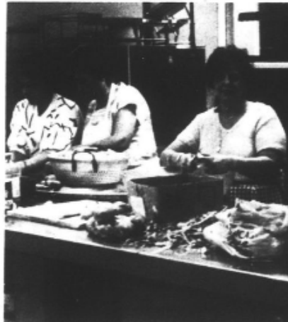
Volunteers from the Ramallah Women's Club preparing an Arab Dinner.