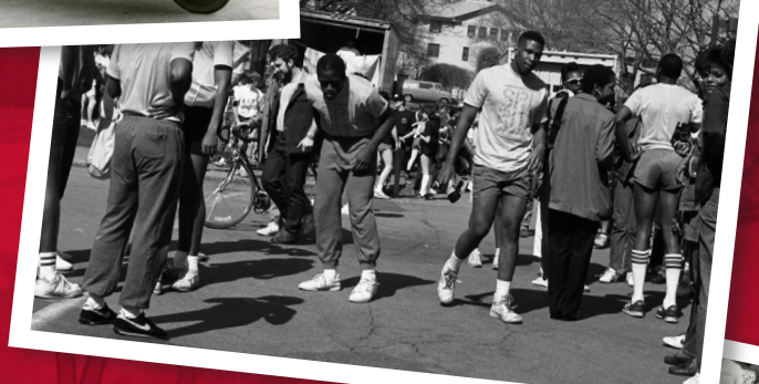
Image credits: Kappa Sigma's design winner, 1950 (background), A circus-themed buggy for a circus-themed Carnival, 1953 (top right), DU's hybrid buggy, "Captain America," 1970, SPIRIT's first victory, 1987, and Pi Lambda Phi's "Blue Dolphin" (also known as "Beast") prepares for the first heat of the first women's race, 1979.